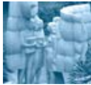
Coming Soon Admissions Officer