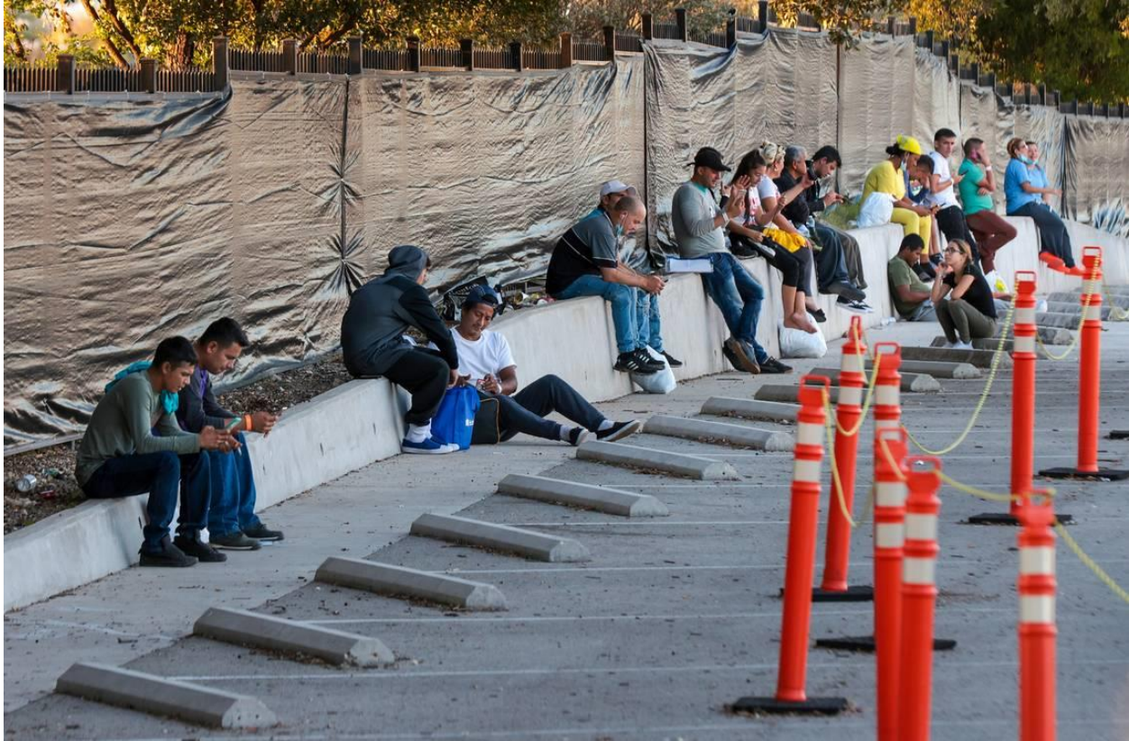
Venezuelan migrants sit and attend to their cellphones in the closed parking lot of San Antonio's Migrant Resource Center.