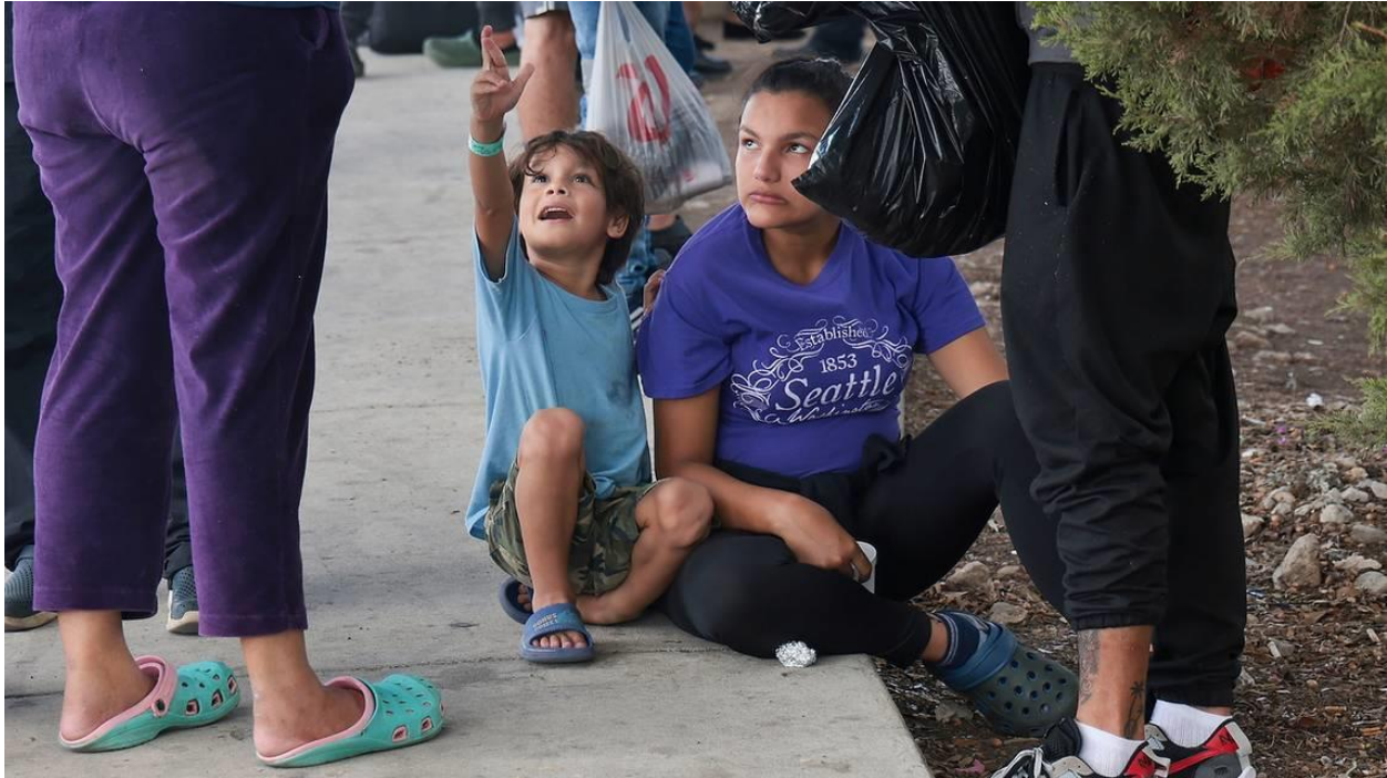
Migrants arrive at and depart from the Migrant Resource Center in San Antonio after crossing the Mexico-U.S. border in Eagle Pass, Texas.

at the shelter, people outside the shelter told the Herald they would be asked to leave, regardless of whether they had somewhere to go. It's an anticlimactic end to the months-long journey.