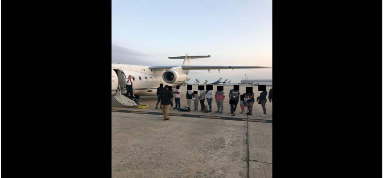
Migrants, their faces obscured, outside the plane that ferried them from Texas to Martha's Vineyard, Massachusetts. Florida taxpayers paid for the charter.

nomination in 2024. Operatives working for the state recruited migrants in San Antonio, offering them free flights to Martha's Vineyard and saying jobs and aid would be waiting for them.