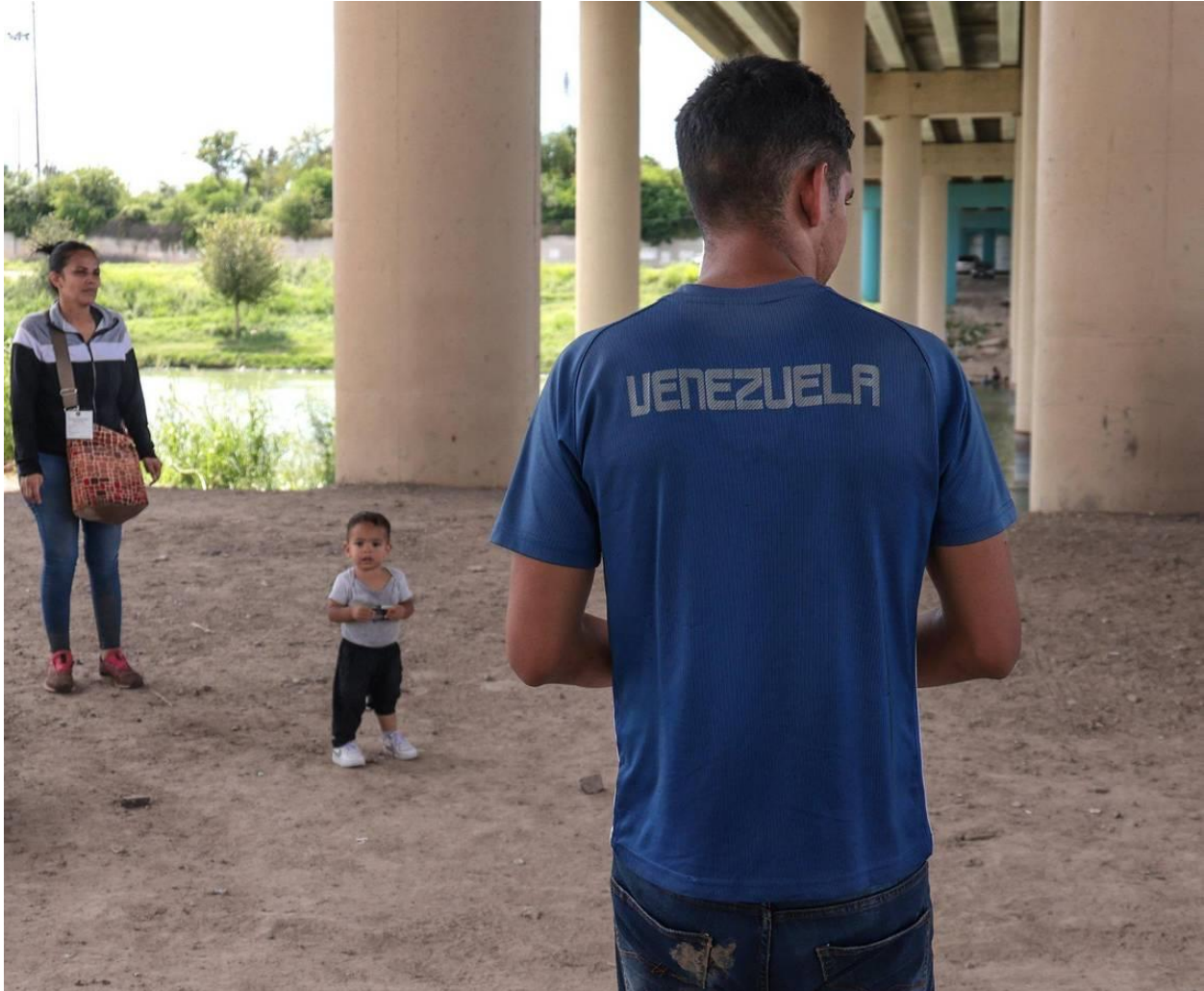
Venezuelan migrants wait for the arrival of U.S. Border Patrol after crossing the Rio Grande.

rooms, according to various outlets. She then arranged for the migrants to board two flights that landed in Martha's Vineyard on Wednesday.