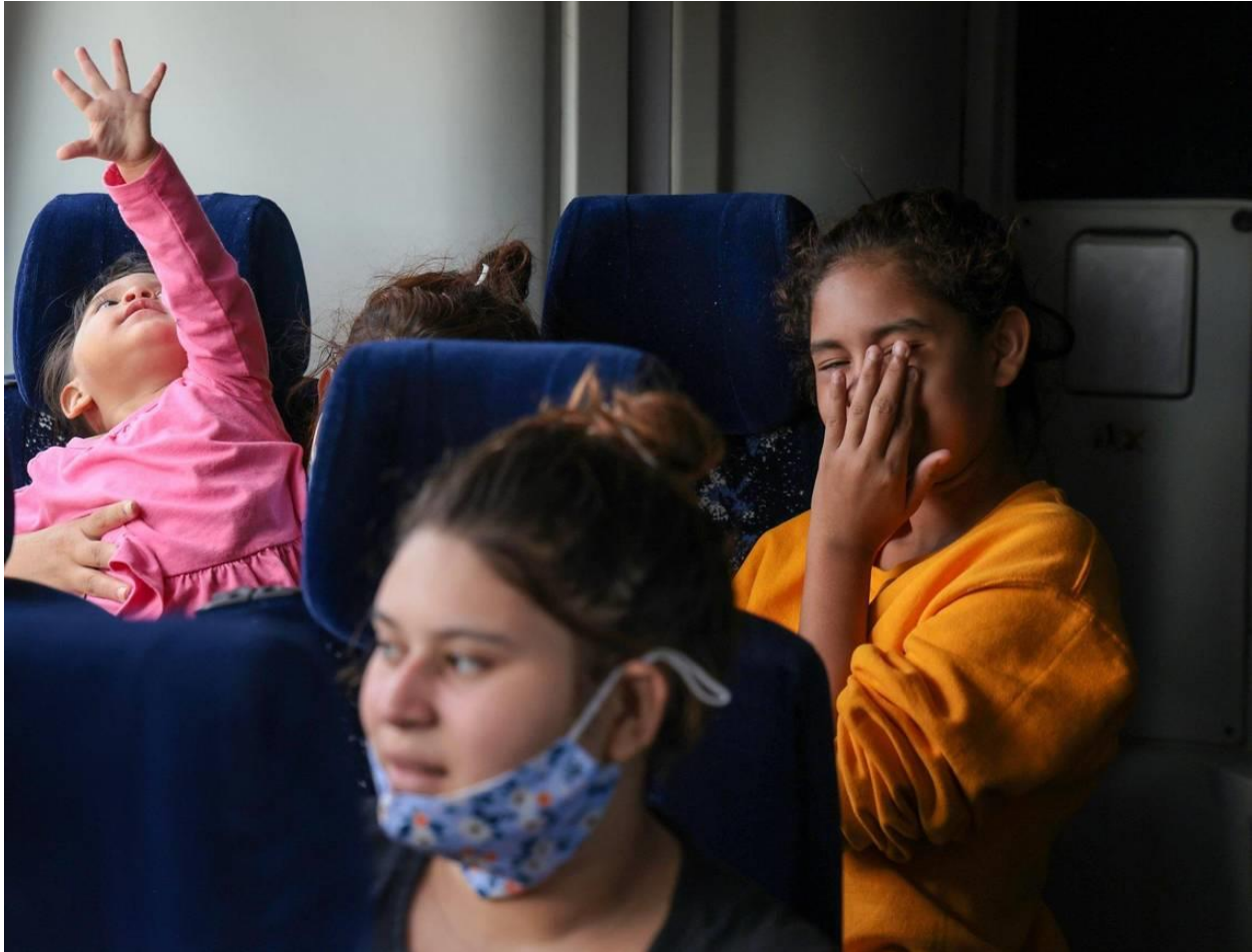
A busload of migrants from Venezuela, Nicaragua and Cuba prepares to be shuttled from Eagle Pass, on the Texas border, to San Antonio by a group of volunteers from the League of United Latin American Citizens. The trip took place on Sunday, Sept. 18, 2022.

CPB's Del Rio Sector, which includes Eagle Pass, has seen a huge jump in migrant crossings over the last fiscal year, with the number of encounters doubling, federal border statistics show.