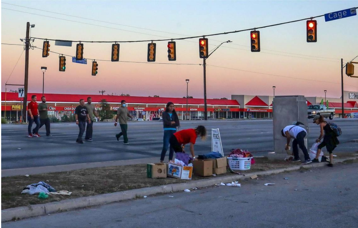
Migrants cross the street outside San Antonio's Migrant Resource Center to look through donated boxes of clothes and momentarily escape the confines of the city's only migrant shelter.