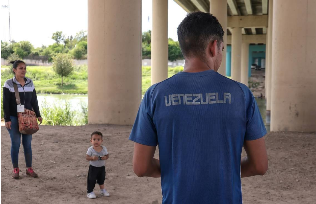
Venezuelan migrants wait for the arrival of the U.S. Border Patrol after crossing the Rio Grande on Sunday, Sept. 18, 2022.

The state budget approved the relocation only of “unauthorized aliens” from the state of Florida, the lawsuit pointed out — not migrants living in Texas after presenting themselves to border authorities and receiving approval to remain in the country pending their asylum hearings.